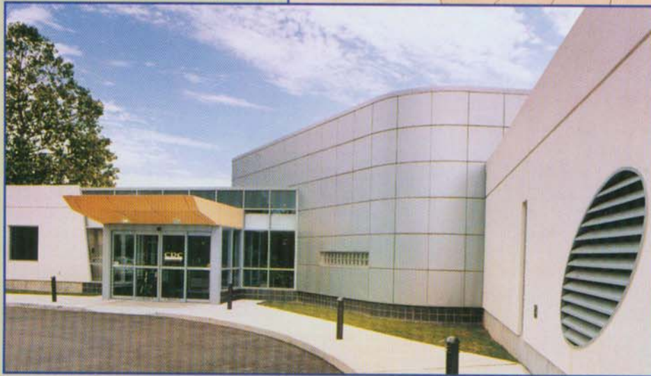
Van Kijk, Pace, Westlake Architects, Cleveland, OH

AND FINISHES • WIDE VARIETY OF PROFILES AND