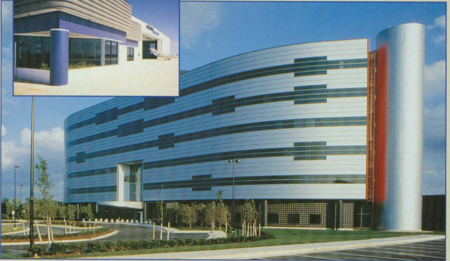
Kessler Associates, Inc., Detroit, MI