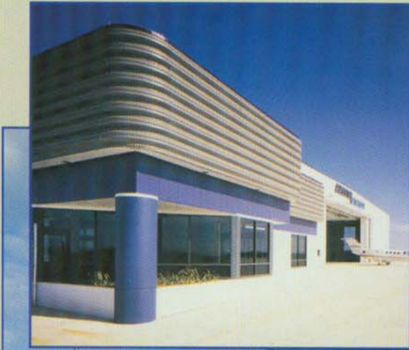
Rossi & Associates Inc., Toledo, OH