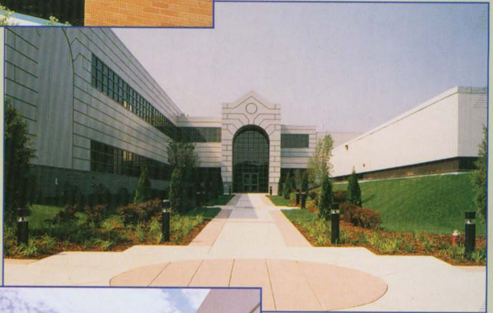
Architectural Resources Cambridge Inc., East Walpole, MA